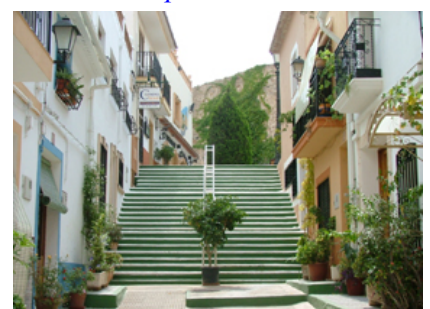
The Steps To The Old Walls