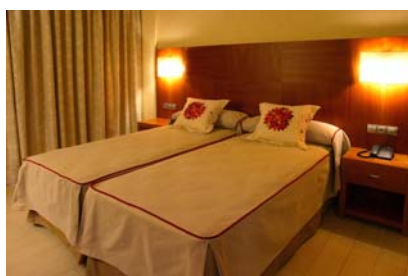
Elegantly Appointed Rooms