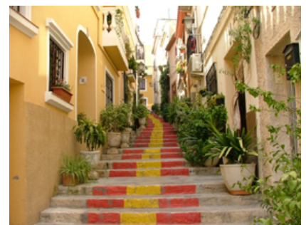
Calpe Old Town