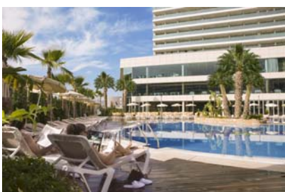
The Outdoor Pool